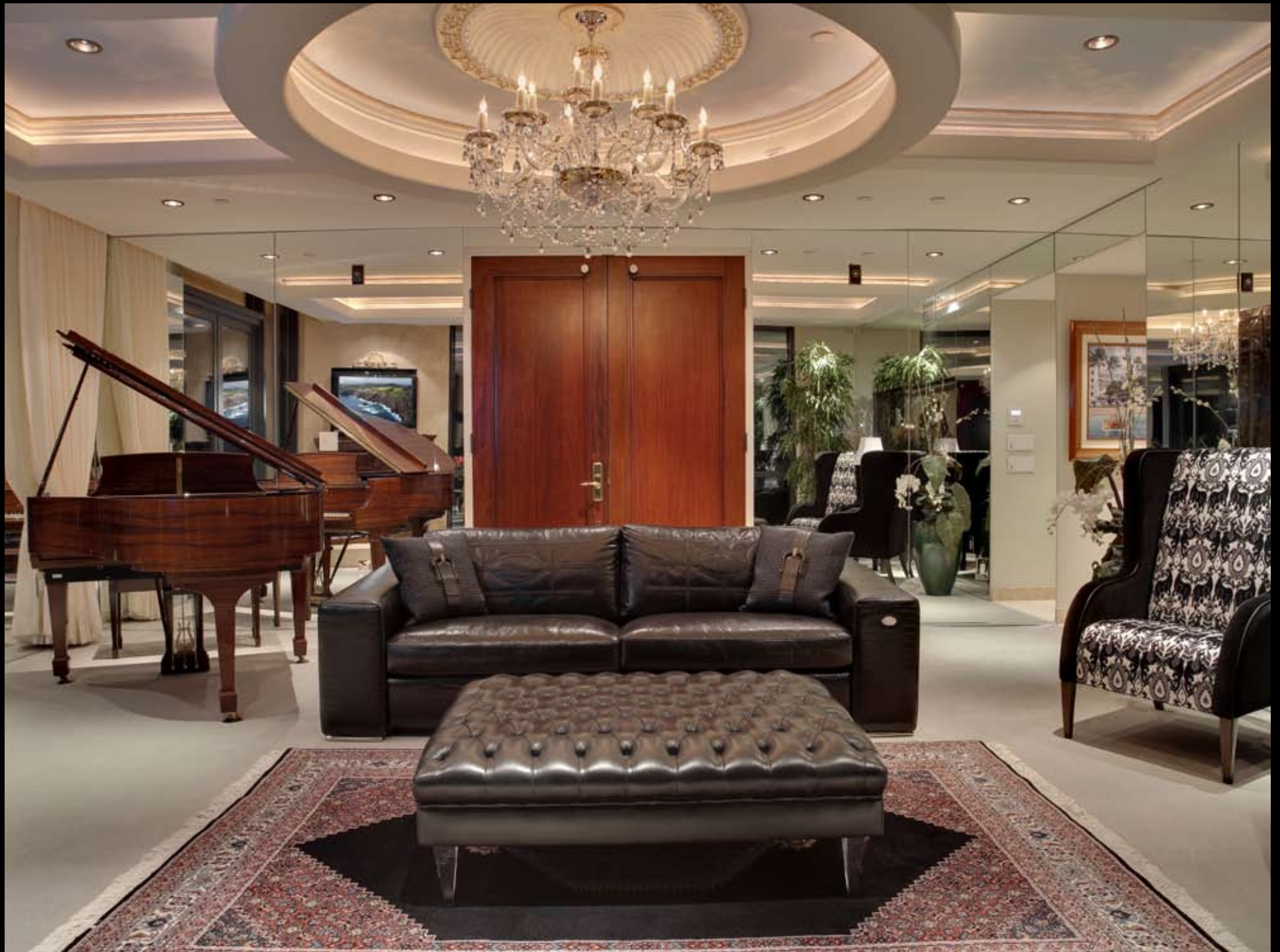
THE GRAND SALON MAIN ENTRANCE FOYER WITH A 300 GALLON SALT WATER LIVING AQUARIUM