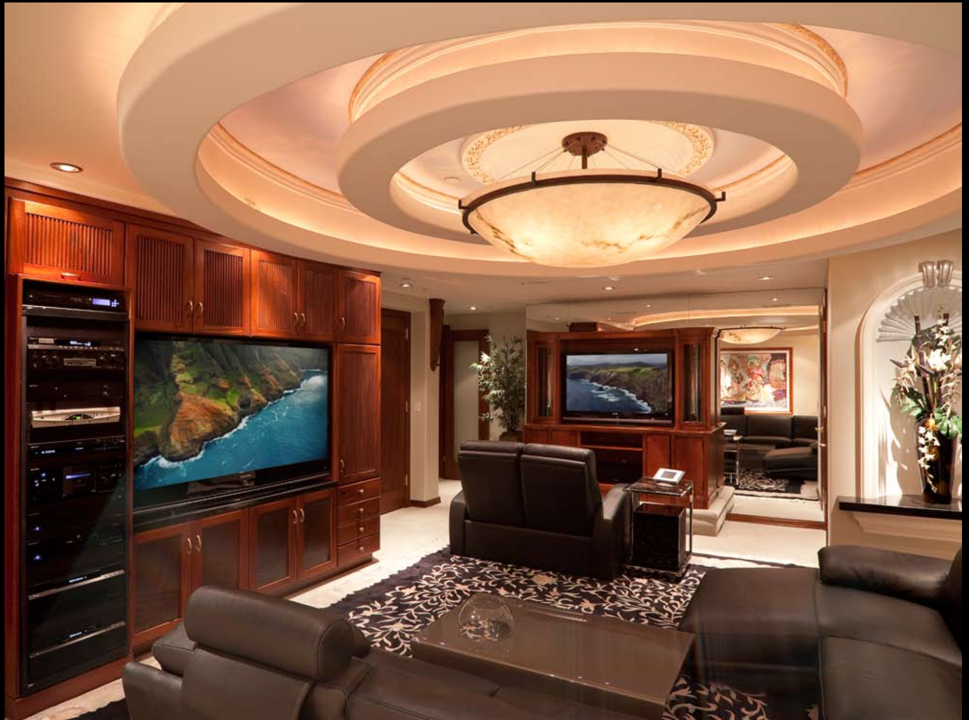
THE WORLD'S ULTIMATE MEDIA & HOME MOVIE THEATRE