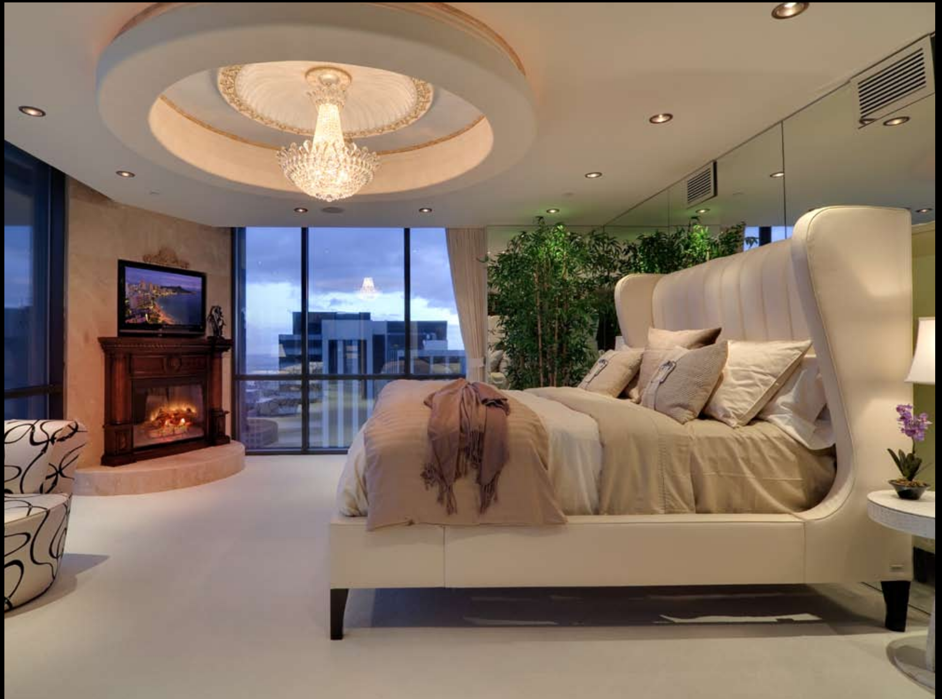
CUSTOM, HAND CRAFTED CIRCULAR OLD ITALIAN COFFERED & HAND PAINTED CEILING THROUGHOUT THE PENTHOUSE