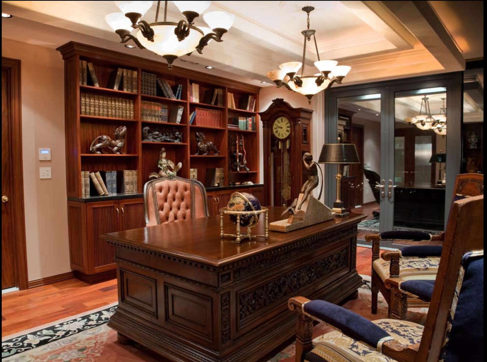
THE LIBRARY, STUDY IN PRESIDENTIAL STYLE