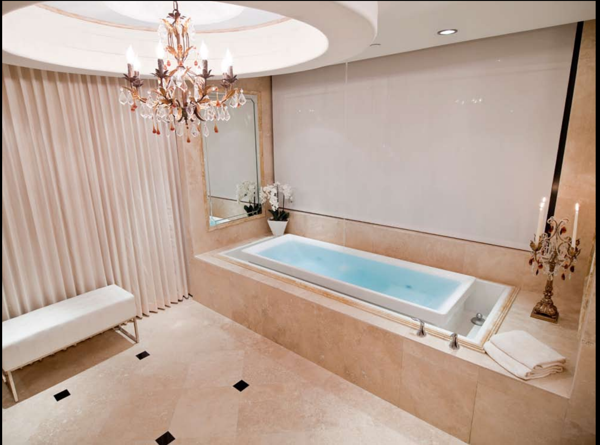
ELECTRICALLY CONTROLLED DRAPES, LUTRON MOOD LIGHTING AND SONY SURROUND SOUND