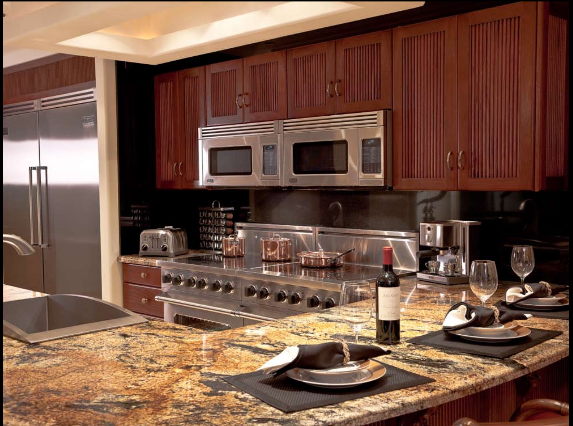
ULTIMATE GOURMET CHEF KITCHEN