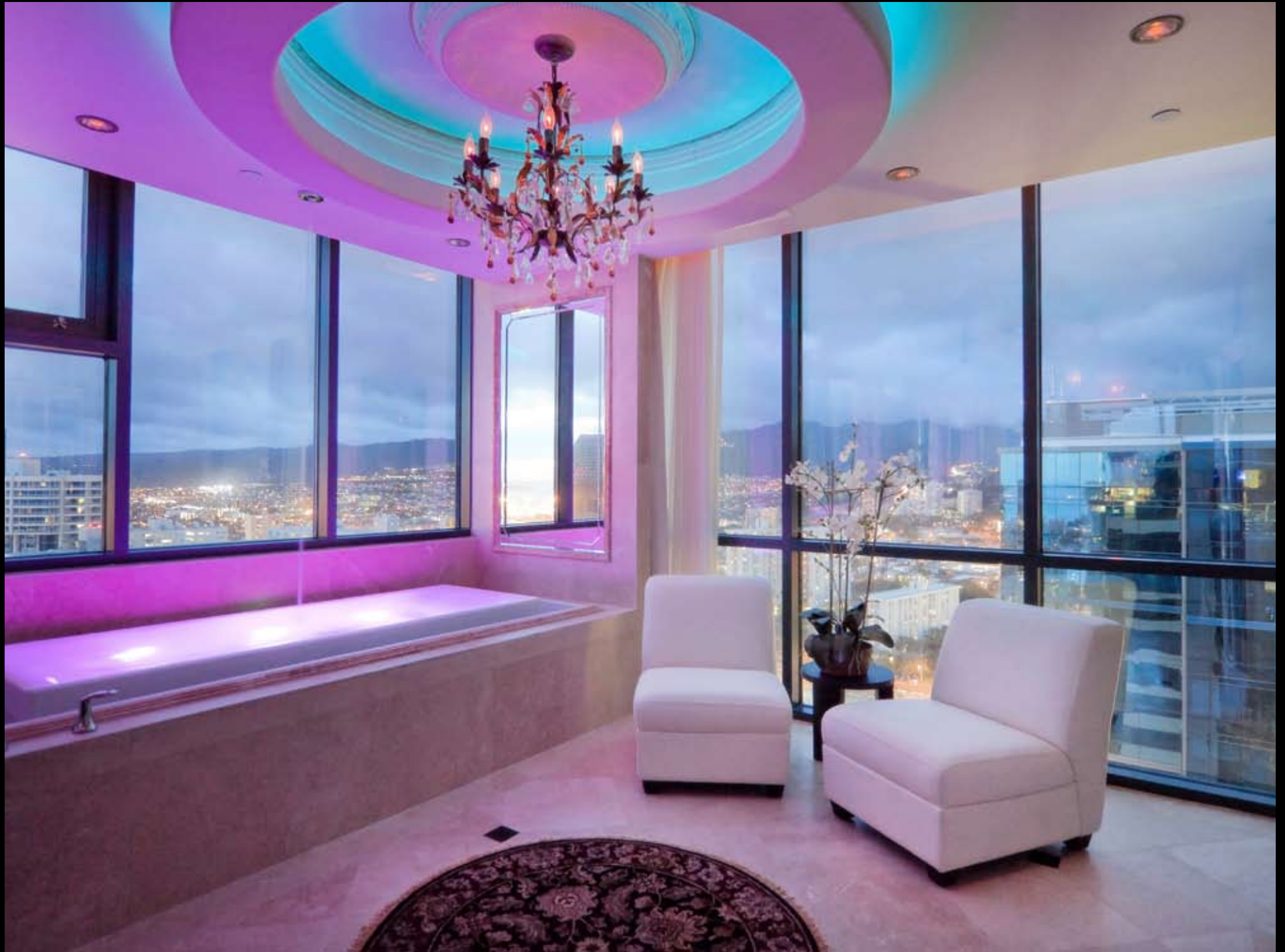
BATHROOMS DESIGNED FOR THE MOST DISCRIMINATING OF OWNERS