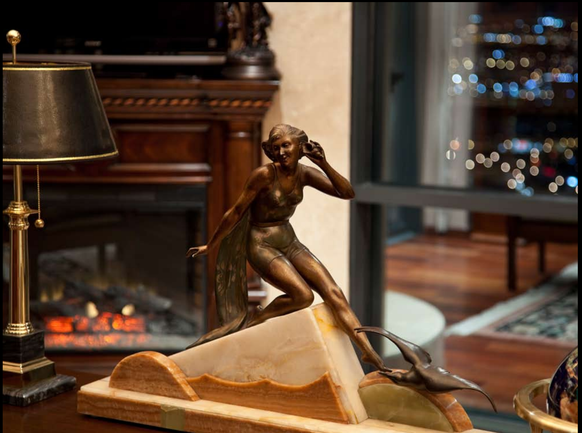
THE KALEWALANI PENTHOUSE SUITE ENVELOPS EXQUISITE ART EVERYWHERE YOU LOOK