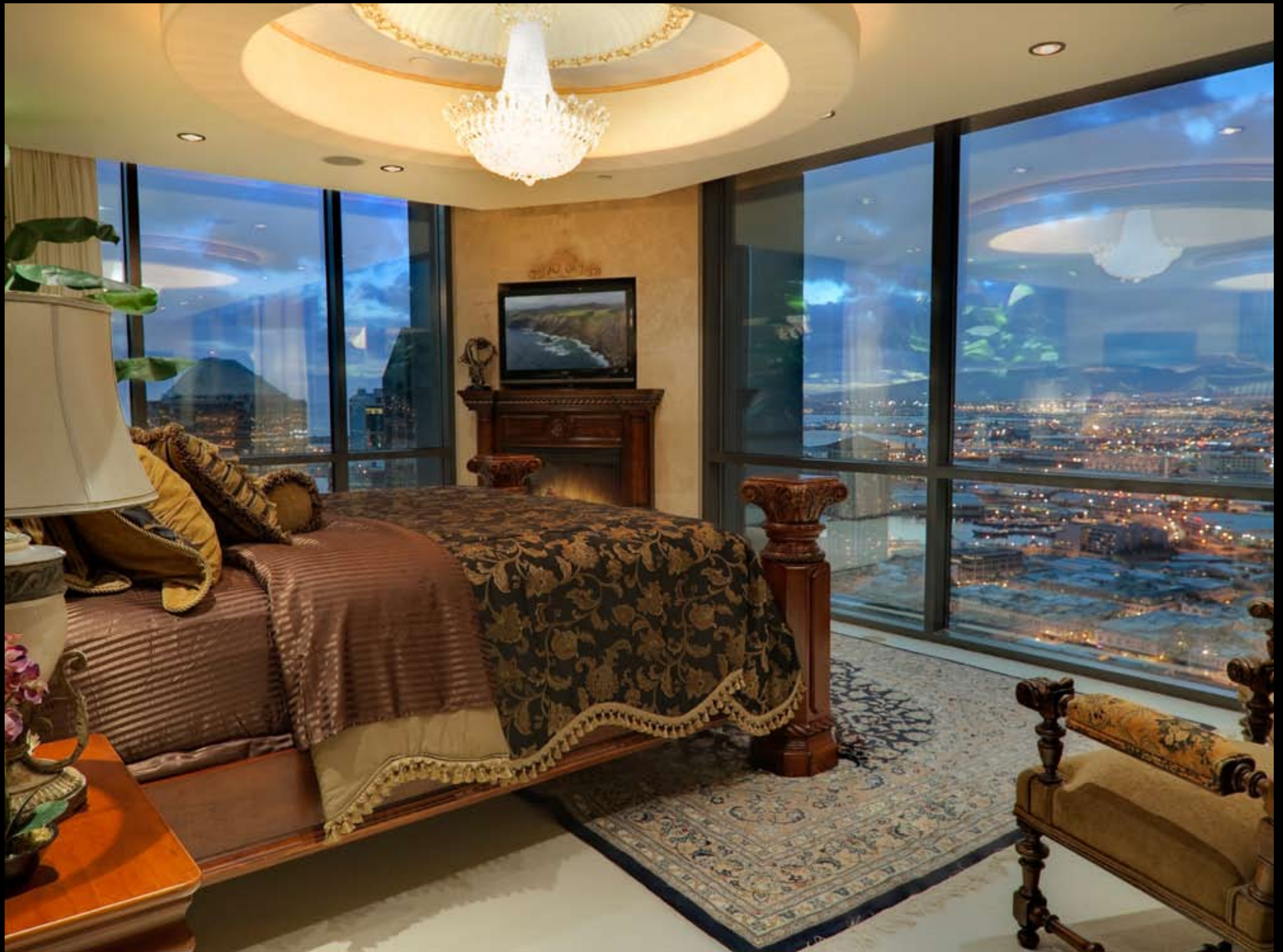
THE ULTIMATE KING KAMEHAMEHA MASTER BEDROOM SUITE