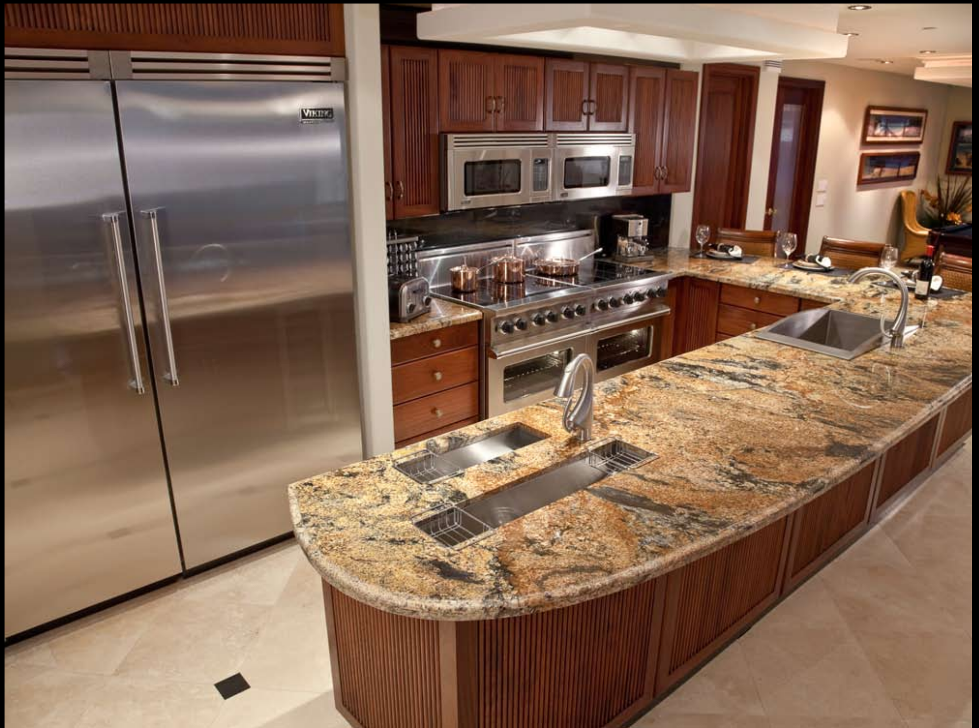
AN INCREDIBLE LUXURIOUS BLEND: RARE STONE, WOODS & STAINLESS STEEL SURROUNDS THE MASTER CHEF OF THE HOUSE