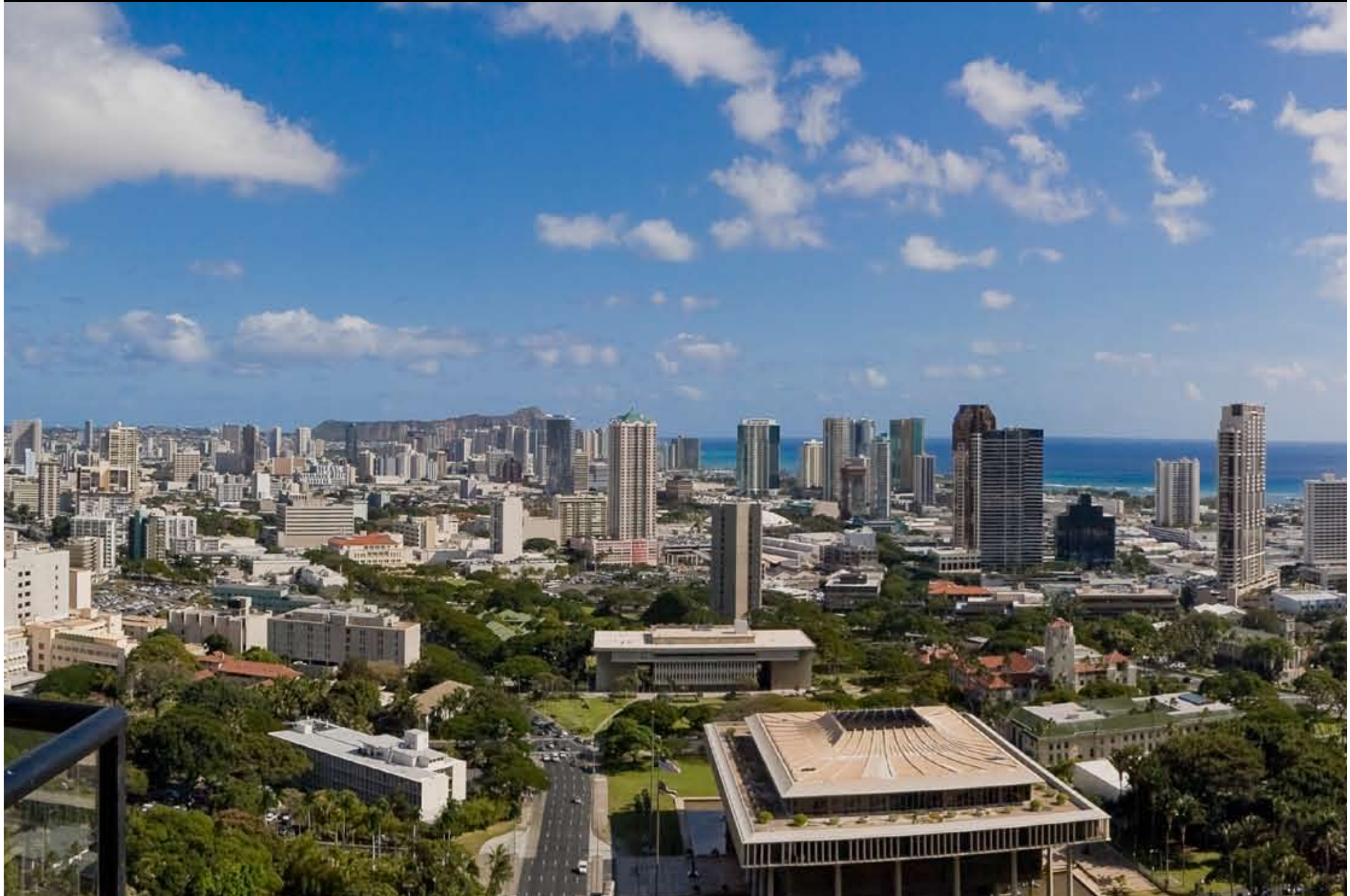
WAIKIKI, WORLD FAMOUS DIAMOND HEAD AND THE BLUE PACIFIC - IT'S ALL YOURS