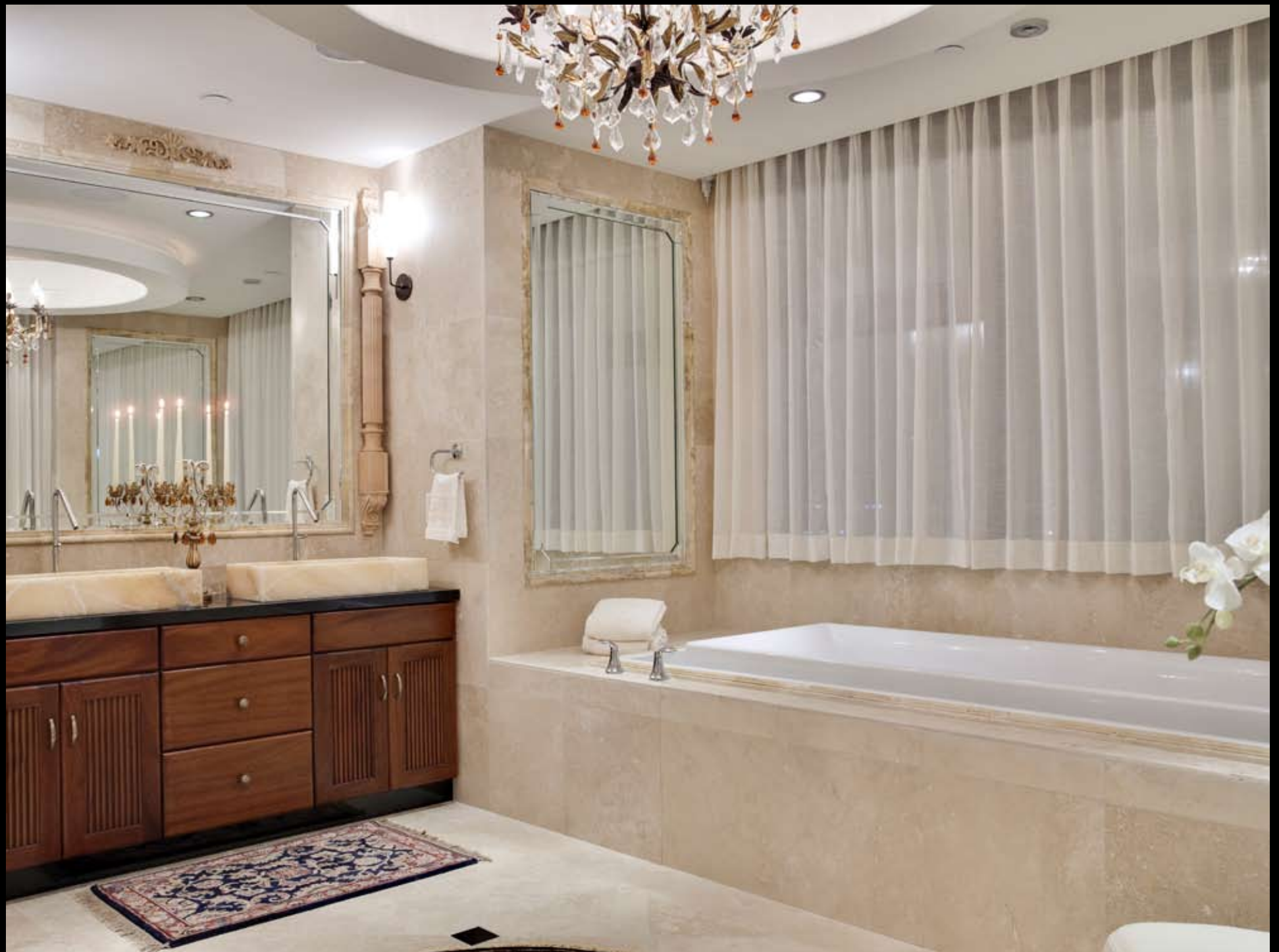
EXCLUSIVE USE OF STONE & RICH CUSTOM AFRICAN MAHOGANY VANITIES