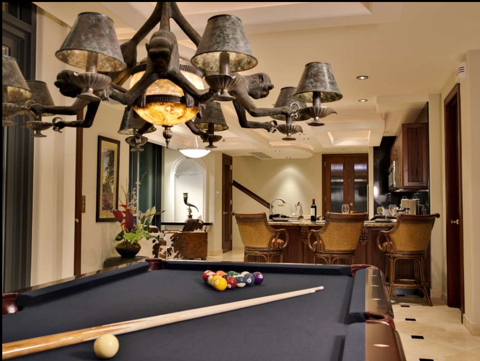
THE BILLIARD ROOM WITH A FOREVER & ENDLESS VIEW