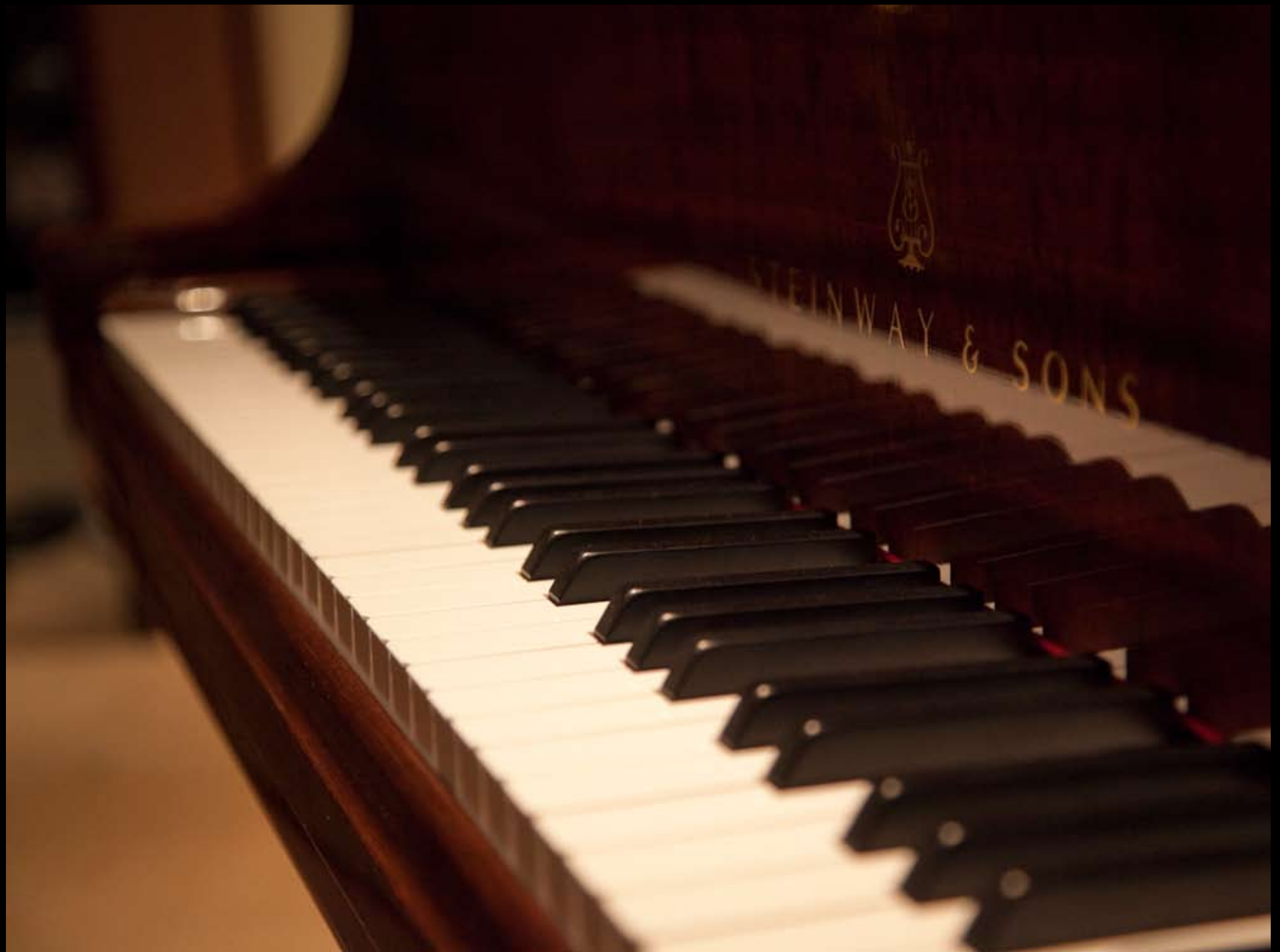
THE ONLY EVER BUILT KOA WOOD STEINWAY & SONS GRAND PIANO IN THE MAIN SALON