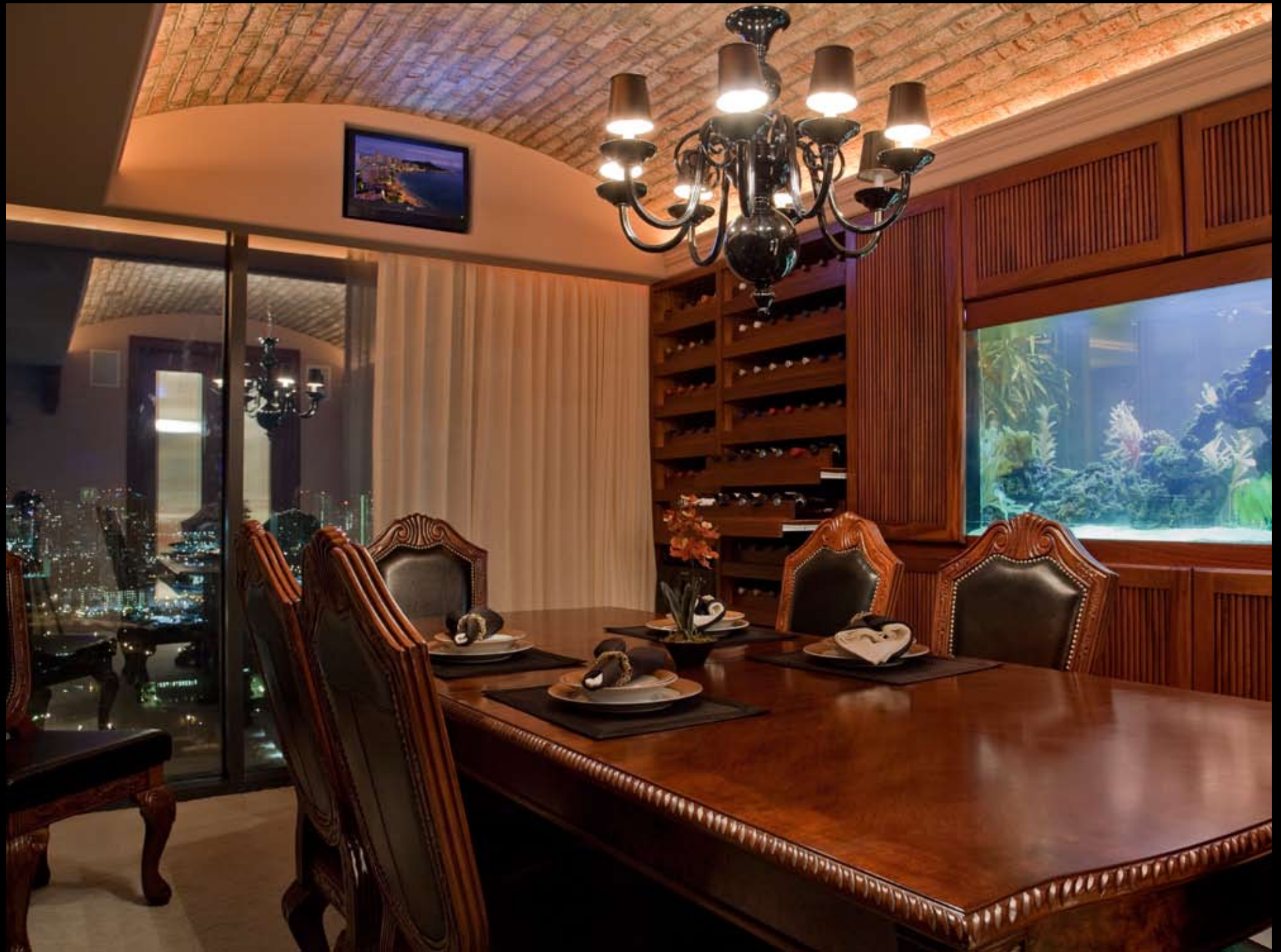
156 BOTTLE, OLD WORLD WINE CELLAR