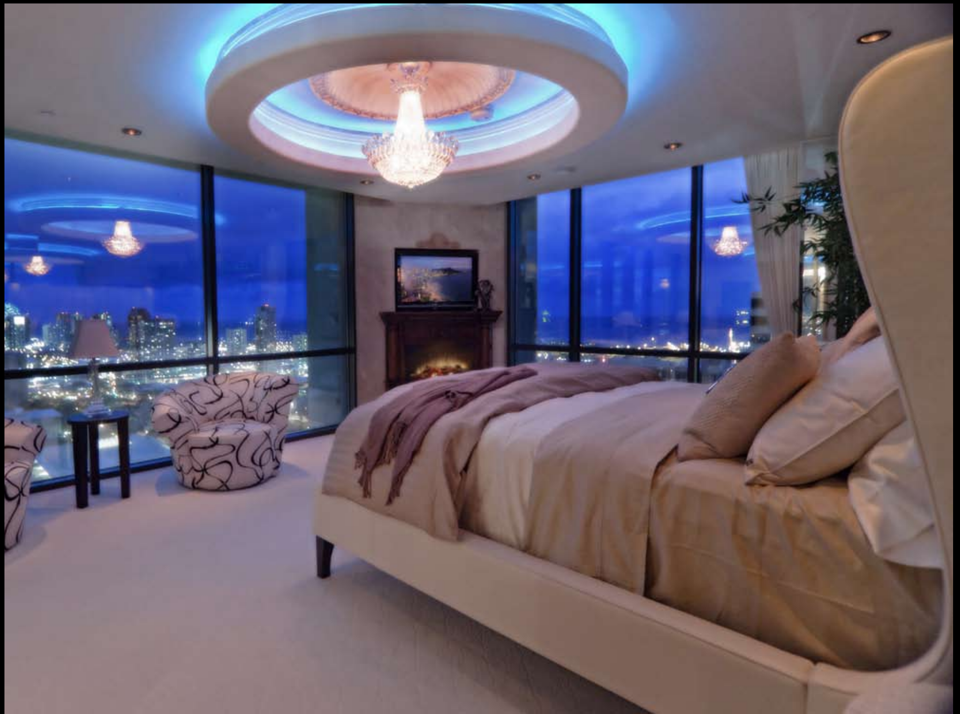
THE FENDI INSPIRED IMPERIAL MASTER BEDROOM SUITE